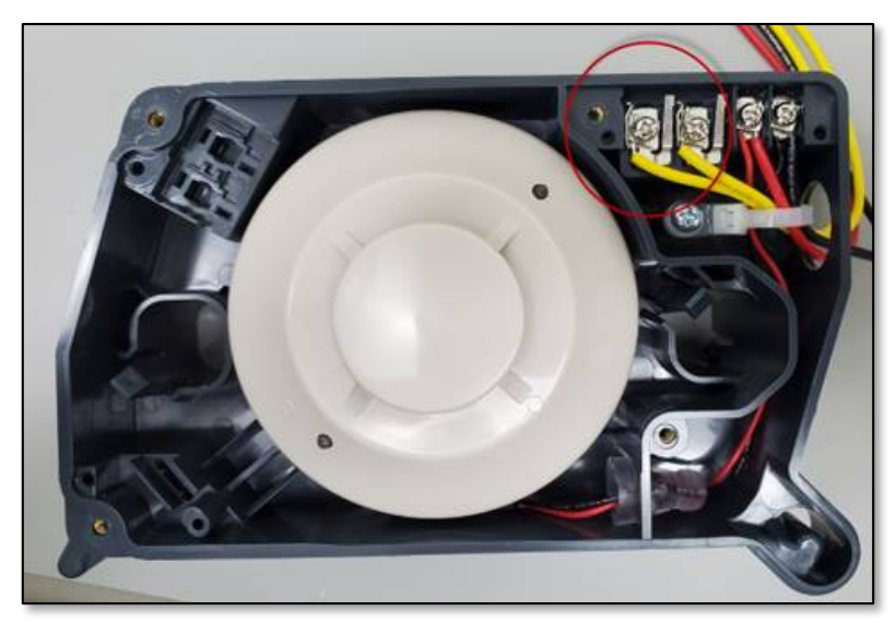
Figure 1. Smoke Detector Cover

If the System Sensor D4120 duct smoke detector is displaying a solid Amber LED, then this is the device's indication that the cover is either missing or not properly tightened.